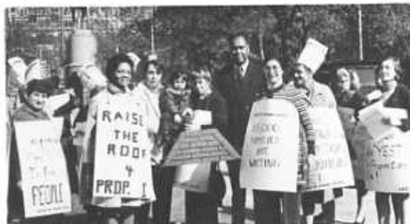
1968: Participants in League conference on low-income housing