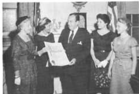
circa 1960: Mayor Wagner presents Proclamation to N.Y.C. League