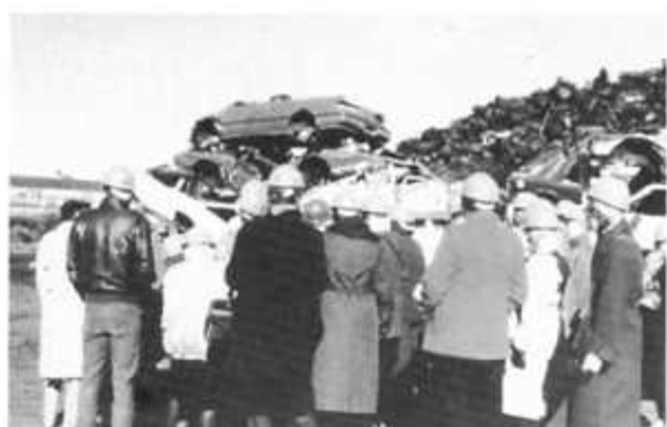
1991: On-site observation of scrap metal recycling plant