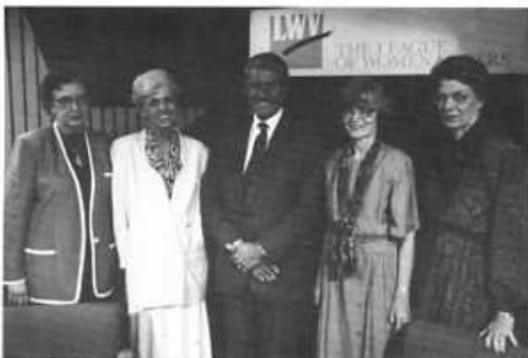
1991: League officers & WABC/TV's Bill Beutel at live broadcast of U.S. Senate Democratic Primary Debate