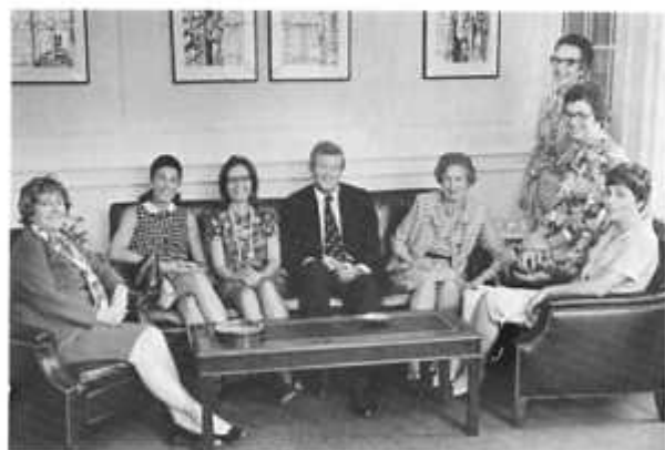
circa 1970: Mayor Lindsay with League program committee members: