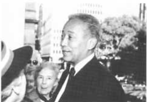
1991: Mayor Dinkins with League committee members