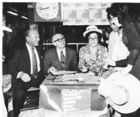
1974: Mayor Beame at first underground registration drive — IRT Grand Central Station