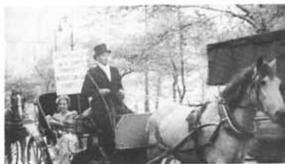
1960s: Demonstration for Court Reform