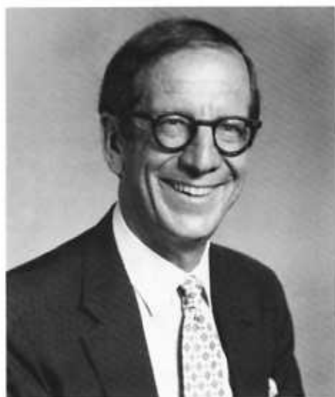
Senator Roy M. Goodman