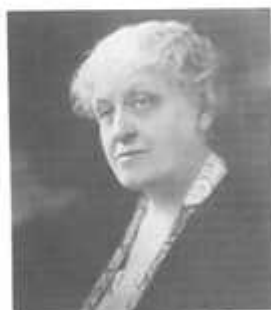
Carrie Chapman Catt Founder of the LWV