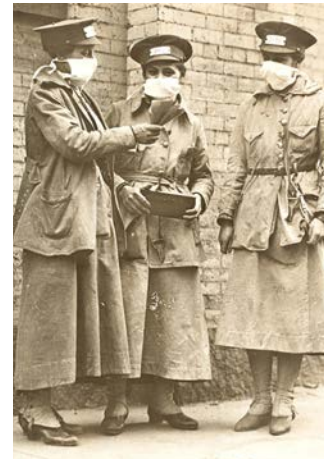
Train conductors in New York, wearing masks for protection against influenza

The 1918 Spanish Flu and the 2020 Covid-19 pandemics shared remarkable similarities and striking differences. Both had social distancing restrictions, but in 1918, schools were never closed and Broadway theaters remained open. What was also undeterred at that time was New Yorkers’ desire to vote, refusing to let the pandemic prevent them from exercising their fundamental rights as citizens.