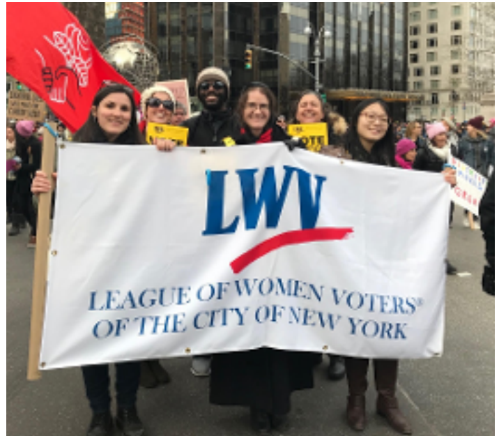
LWVNYC at January 2018 Women's March