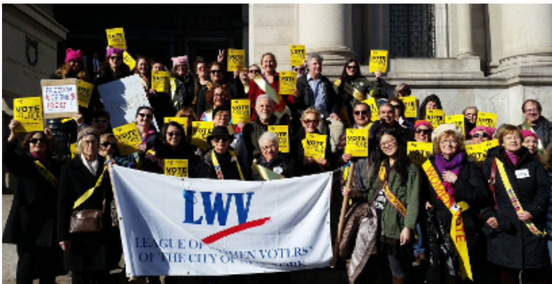
LWWNYC stands up!