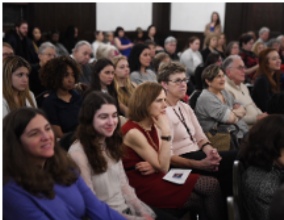
The crowd is wowed.