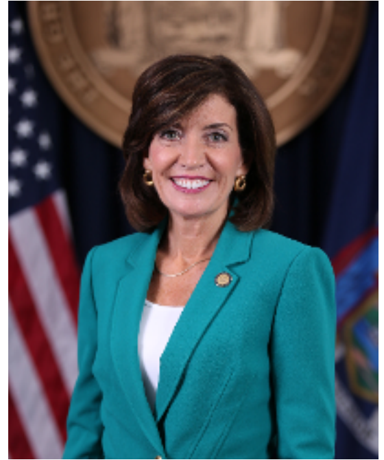
Lieutenant Governor Kathy Hochul.