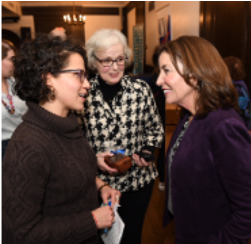
Kathy Hochul chats with audience members.

@ The New York Society for Ethical Culture