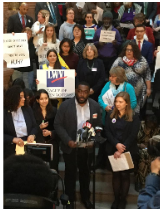
LWVNYC supporting early voting legislation in New York State in conjunction with Let NY Vote