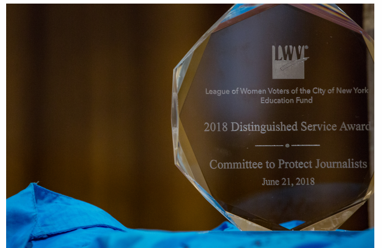
LWVNYC awards the Committee to Protect Journalists the 2018 Distinguished Service Award