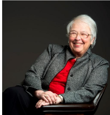
Chancellor Carmen Fariña.

The overlying principle behind the Chancellor's programs is that we need well-educated children. High School students are mentoring those in middle school, and middle schoolers are mentoring elementary school students. Now every high school student can take the SAT exam in their own school at no cost! There is an education program for inmates at Rikers Island and SAT exams are offered. She is proud that last year, 8,000 seniors registered to vote. Chancellor Fariña's closing comment was "If we don't have public education, we don't have a democracy."