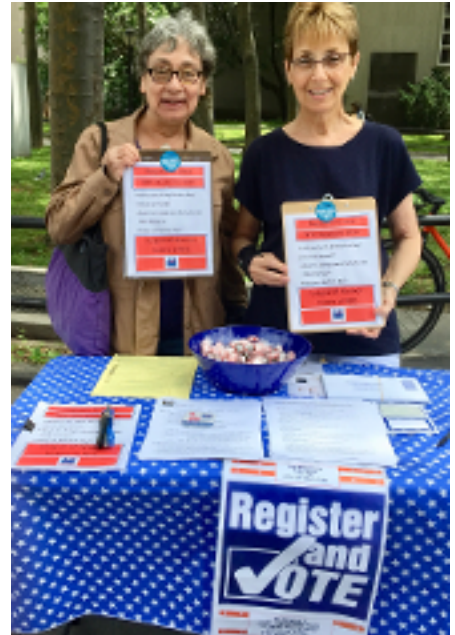
LWVNYC volunteers during a voter registration drive.