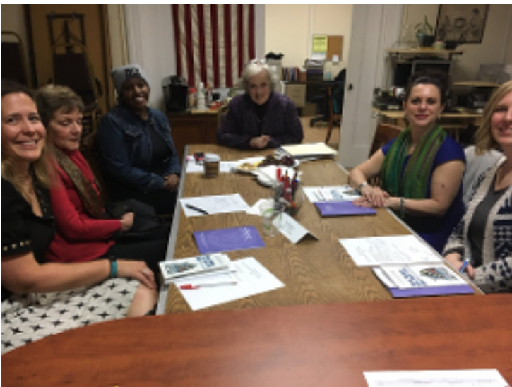
A meeting of the Membership Committee.

Check the link on our website where you may submit questions you would like asked of candidates running for City Council and Borough President. We will need League members to assist that evening and members who reside in the district or want to attend should email the office.