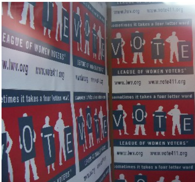
The Windows of ABC Carpet and Home displayed The League's Placards for weeks before Election Day