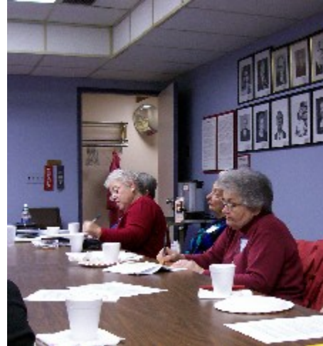
October 18 th , 2006 General Meeting Financing Education: Charter Schools

On the foundation of the first meeting and additional printed materials, and with the invaluable assistance of the study committee, members who attended the Consensus meeting on November 8 th were able to reach overall agreement on matters related to Charter Schools, which may be the subject of state legislation in the coming session. The results of the lengthy, sometimes heated, discussion were approved by our own board and forwarded to the State League, which must determine whether there is statewide agreement on these complex issues.